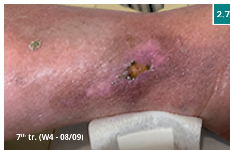
Figures 2.7, 2.8 Ulcer regression due to a small trauma.