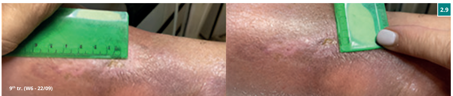
Figures 2.9 Ulcer condition after 5 weeks since the first treatment, superficial ulcer's area of 0.45cm 2 .