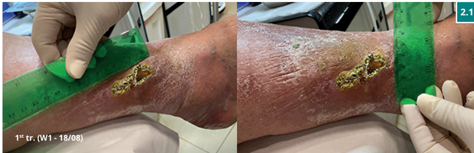
Figures 2.1 Baseline visit, ulcer condition before debridement and first laser treatment.