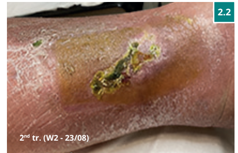
Figures 2.2 Ulcer condition before removing necrotic tissue.