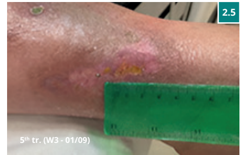
Figures 2.5 In occasion of the 5 th visit the ulcer appear with a granulating base, no exudate, and a superficial area of ~ 2cm 2 .