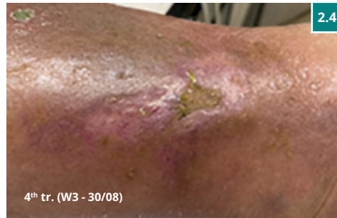
Figures 2.4 The ulcer present depth reduced and eschar lifting with minimal scarring and surrounding skin much improved with significant reduction in leg's oedema.