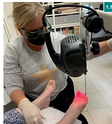
Figures 1.1 Example of the MPhi 5 multidiode head in action during a laser treatment session. The red light 635nm-68nm is used as a pointer, it has a maximum power of 1 mW and no therapeutic effects.

During treatment, the wound showed improvement with a progressive reduction in the superficial area, formation of granulation tissue, and reduction of exudate. The surrounding tissue inflammation also improved as the oedema gradually disappeared (see Figure