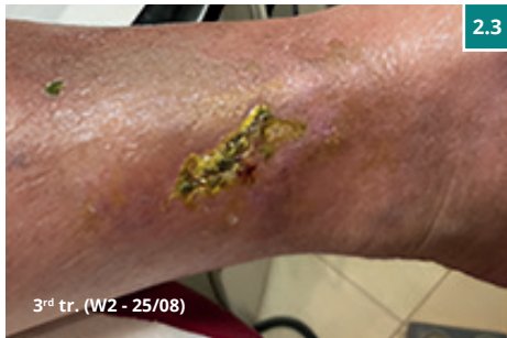
Figures 2.3 Ulcer condition after debridement and 3 rd MLS® laser treatment.