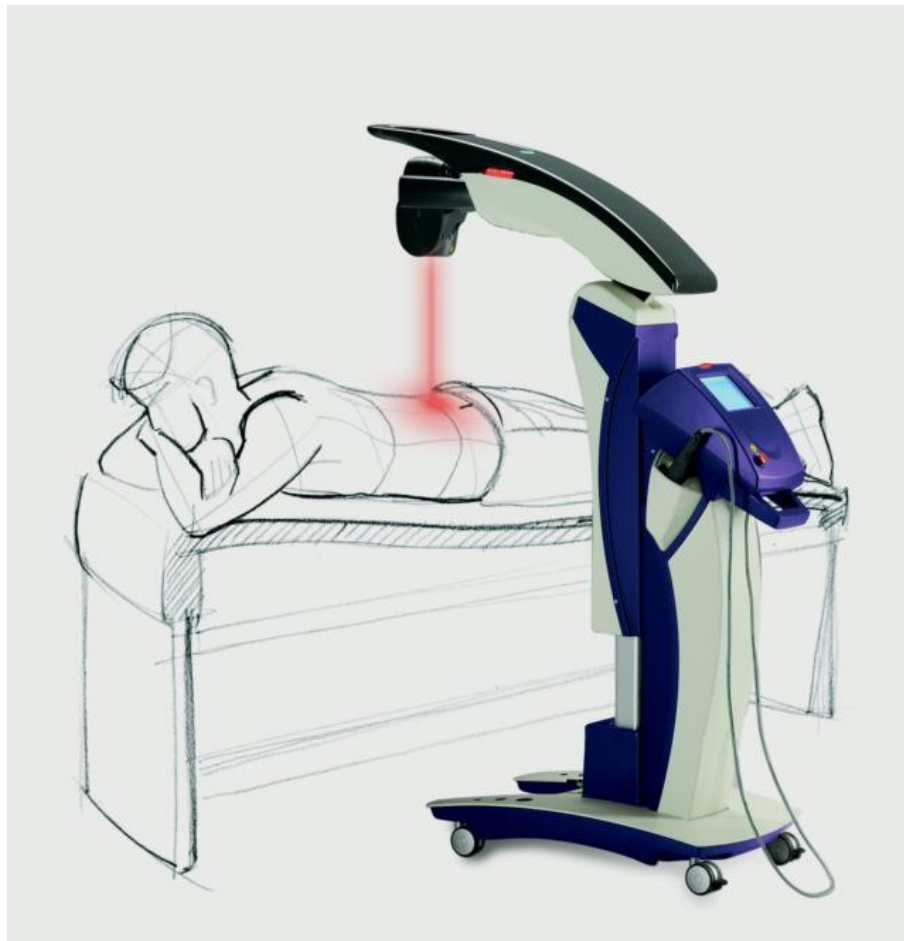
MLS Laser Therapy applied to a back ailment or injury.