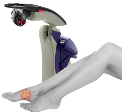
MLS Laser Therapy applied to a foot.

"I was working the Alton High concession stand this spring and was approached by a mother and her 15-year-old daughter, who was in a walking boot, hobbling around. At this point, I'd had the laser in my office for only two days. I asked what had happened and it turns out the girl had bruised her foot while playing soccer and had been in the boot for two straight weeks. When she removed the boot, she couldn't walk without being in pain. Six treatments with the MLS Laser later, she was back playing soccer."