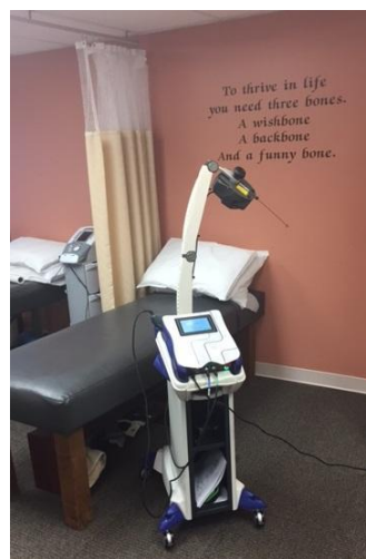
The MLS Laser Therapy system in Bemis Family Chiropractic.

"All of my patients have been doing very well with it," he said. "One patient was told they'd be needing a knee