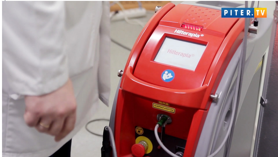
May 18, 11:50 am 0 Linroot 2343 Player insertion code