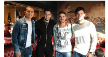
11th July 14:53 4379 0